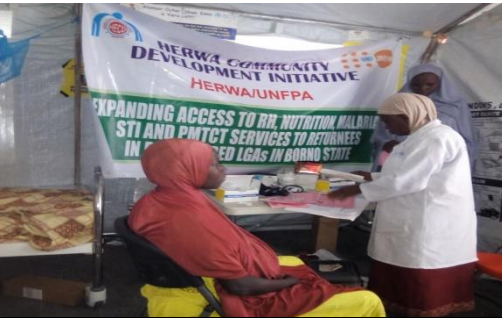
Medical Outreach in Dambo'a funded by UNFPA

Herwa's first HIV/AIDS grant was in 2006 by Borno State Agency for the Control of AIDS UNDER THE HAF 1 HIV/AIDS prevention project supported by the World Bank. The project was implemented in MMC, Dikwa and Monguno. It targeted Most at Risk Populations like long distance drivers, Barbers, Prostitutes and women of reproductive Age. Prevention Messages then included the A, B and C of prevention, as well as encouraging beneficiaries to get tested and reduce risky behaviours like multiple sexual partners, discourage sharing of sharp objects, and drugs abuse. Two more grants were again secured one from BOSACA in 2015 and NASACA in 2017. Both these projects had similar target population as they came under the HAF 2 World Bank Project.