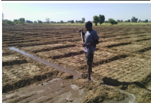
A beneficiary inspecting his irrigated plot in Damboa Local Government Area

Through support from the World Bank, Herwa distributed relief materials to internally displaced persons from Chibok, Konduga, Damboa, Kaga, Askira / Uba, MMC, and Jere LGAs of Borno State. The beneficiaries got Agro-processing equipment; work Bulls and ploughs, Goats, and sheep as well as irrigation pumps and sprayers to cultivate rice, vegetables. The objective of the project was to enable the IDPs to engage in their farm activities wherever they are to cushion the effect of being internally displaced. With support from NSRP, Herwa executed a community sensitization project called “Know your Neighbour” which taught community members how to secure their communities against the Boko Haram insurgents. The project enabled beneficiaries to arrest 5 Boko haram insurgents while volunteers reached over 18,000 community members with messages on best practices for securing their ward.