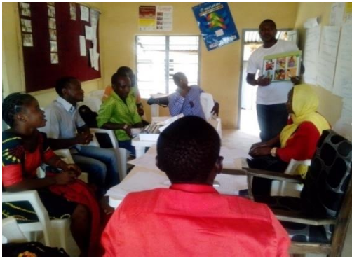
Dooshima Alpha on set demonstrating the proper use of male condom with a volunteer