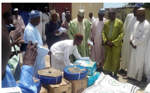
Distribution of irrigation equipment supported by world Bank and National Fadama Development Project

that indiscriminate dumping of refuse is stopped and ensure that people sort their solid waste properly for the purposes of recycling and reusing solid waste in Borno State. The importance of