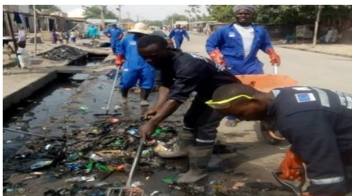
Beneficiaries busy cleaning at Bulabulin worksite.

In 2018, desirous of fast-tracking the return of 3,000 IDPs from Bama LGA to their communities, the United Nations Development Program partnered with Herwa to distribute 12,000 bags of Cement and 6,000 bundles of corrugated iron sheets to rebuild their dilapidated homes. Each beneficiary was also given the sum of 40,000 Naira to pay for needed building materials like doors, wood products, and additional labour to rebuild destroyed homes. The beneficiaries have since all