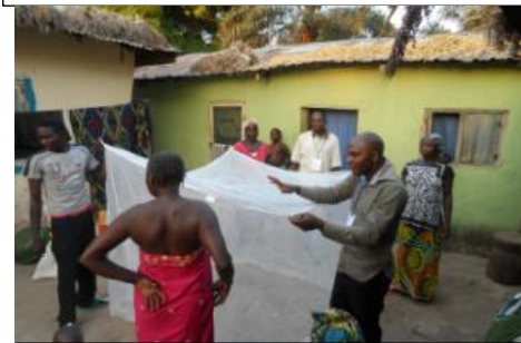
Demonstration of the use of LLN use in Awe (MAPS Project) Nasarawa