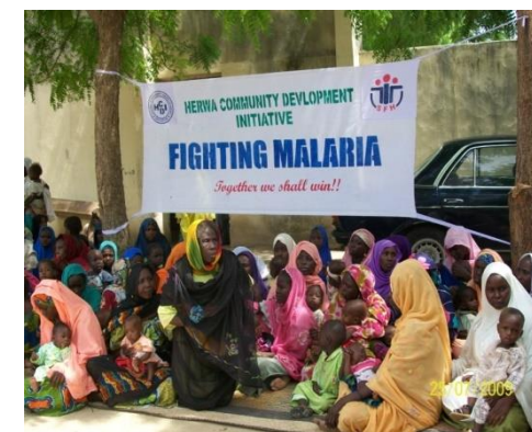
Malaria prevention Sensitization and LLN promotion in Gaiibo in 2012

recommendations on gender and PSEA to protect beneficiaries.