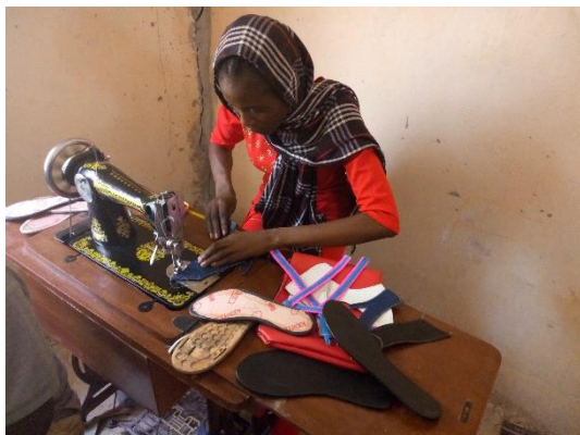
A female youths trained by the CJTF empowerment Project making Shoes

Nasarawa state -Herwa has also had successfully executed a project on Malaria prevention in Nasarawa state-supported b Malaria Action Program for States that focussed on prevention messages targeting pregnant women and children under the age of five in twelve communities of Doma, Nasarawa, and Eggon LGAs in 2013. That Malaria project has been renewed for another five months with a completion date of June 2015. Herwa is currently executing another project on HIV prevention in Nasarawa State with support from NASACA in Lafia, Wamba, Akwanga, and Keffi.