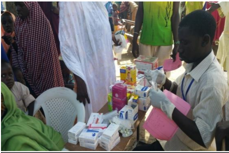
Herwa's Medical Personnel Medical Outreach in MAFA supported by