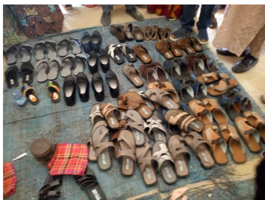
Samples of Shoes Manufactured by the beneficiaries of CJTF Empowerment Project

The UNHABITAT (Kenya) supported trained 120 male and female youths in computer literacy in 2009. Much of the equipment procured by the project is intact and in excellent technical condition. More beneficiaries are still benefitting from the facilities.