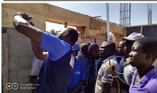
Beneficiaries of CJTF Empowerment Project Receiving practical Electrical wiring Training

Supported by the European Union, the CJTF Empowerment Project was planned to give Livelihood skills to the Gallant youth vigilante group called Civilian Joint task Force. Their role in the on-going fight against the Boko Haram in which the contribution of the CJTF was decisive in chasing the Boko Haram insurgents out of Maiduguri was the justification for the project. The fact that the membership of the CJTF themselves agitated that without any support from the Government will enrage them to take the arms they used to chase the Boko Haram out of Maiduguri made assisting the CJTF to acquire a skill each very appearing to the development sector. Eventually, instead of the