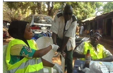
One of TWS peer receiving a condom after undergoing HCT in December 2016