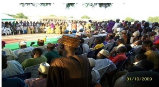
Launch of BOSACA funded HIV and AIDS Prevention Project in Maduganari -2009

Herwa Community Development Initiative is a non-governmental, nonprofit, non-religious, and nonpolitical organization. The organization was formed in 1999 as Herwa Community Development Initiative in response to maternal mortality, the low and pervasive literacy level, rising HIV prevalence, Malaria, tuberculosis, and widespread poverty. The Goal of the Organization is to contribute to easily accessible gender friendly Health outcomes, literacy and Peaceful coexistence in Northeast Nigeria and the country at large.